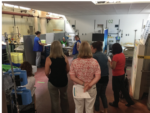
Staff running a test scenario in the PCU mock-up space.

Using information from the PCU tabletops, representatives from the perioperative surgical program worked together during a series of nine mock-ups of the new 40-bed Perioperative Care Unit, testing work flows and patient care scenarios to refine the design.