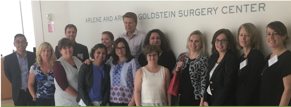
Project team members on a site visit to Columbia Hospital in New York.