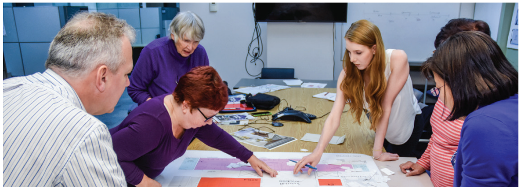
CEAN members provide feedback on the design of the third floor family waiting room.

Members of the VCH Community Engagement Advisory Network (CEAN) ensured patient and family perspectives enriched our plans too, providing feedback on the design and amenities for the new surgical suite waiting room, as well as patient and family communications solutions.