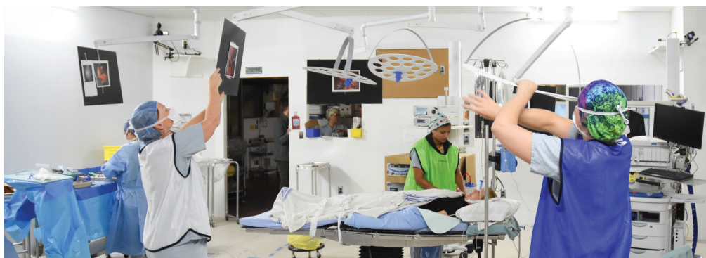
Testing OR design functionality during mock-ups.